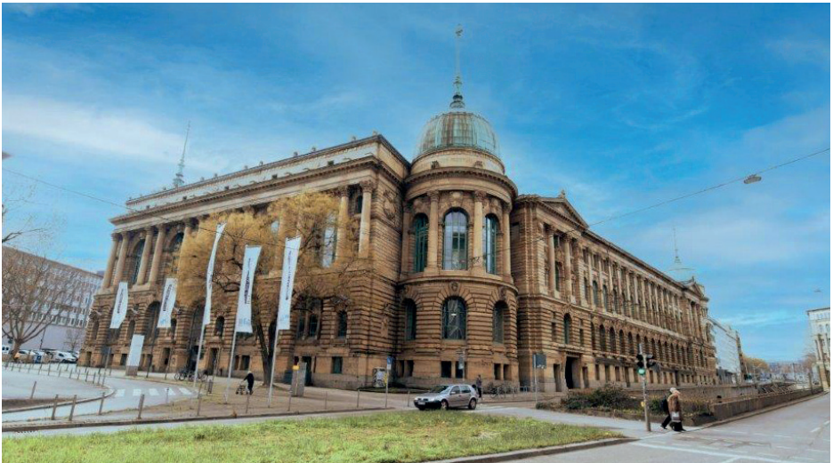
Haus der Wirtschaft Willi-Bleicher-Straße 19, 70174 Stuttgart - Germany

The DSC Organizing Team wishes to all participants and exhibitors a great time at the Driving Simulation Conference Exhibition 2025!